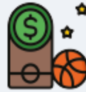
Games of chance