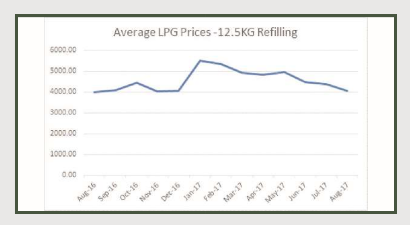
-7.57% month-on-month and 1.63% year-on-year